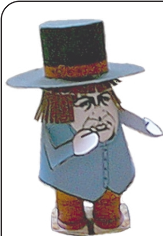
George Fox (1624–1691)

George Fox was born in Fenny Drayton in Leicestershire. In his teens he was upset by people who went to church but were still drunk and dishonest. He travelled north and in 1652, at the top of Pendle Hill in Lancashire, he had a vision to gather good people together. He said that goodness wasn't in churches but in ordinary men and women who listened to God inside them. His followers, called 'Friends' or 'Quakers', worship in silence. They wait for God to speak through any one of them: young or old, rich or poor, man, woman or child. George Fox was working with Quakers in London when he died. He was buried at Bunhill Fields. Quakers don't have priests because there is 'that of God' in everyone. They believe that making a good world for us all needs action. They work for peace and fairness.